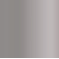
Brushed Aluminum - BAL